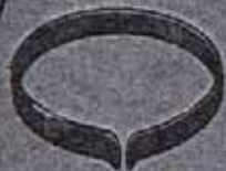
TROUSER BAND Celluloid-covered black No. 1123 1/3 pair.

Every Terry clip is expressly designed for the particular job for which it is intended. In practice it affords the perfect grip . . . not too tight and not too loose. For complete satisfaction your choice should always be Terry's.