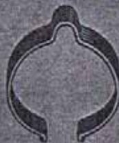
CABLE CLIP No. 186 Enamelled 1/2d. doz. Chromium Plated 1/9d. doz.