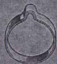
CABLE CLIP No. 399 Enamelled 1/2d. doz. Chromium Plated 1/9d. doz.