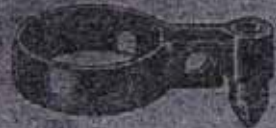
REX PATTERN PUMPCLIP Jaws lined to prevent scratching. In sizes to suit cycles and motor cycles. Chromium plated. No. 692. Motor cycle 2/9 pair. Cycle 2/9 pair.