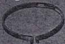
TROUSER BAND in narrow steel. No. 9. Bronzed 5d. pr. Plated 7d. pr.