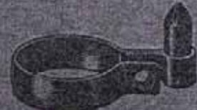
PUMP CLIPS Convex-shaped bands make these clips grip with great strength. Screw threads and slots are deeply cut. One clip is sprung, the other solid. Black enamelled. No. 1171 1/2 pair.